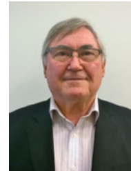
Electoral Area D Director