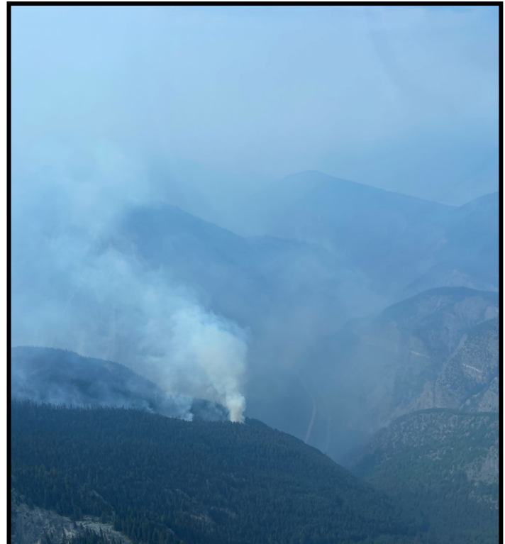
Fire activity on the easternmost flank of the Casper Creek wildfire looking north over the Bridge River (Aug. 20, 2023).

The Evacuation Alert and Order issued by the Squamish-Lillooet Regional District remain in effect. Full evacuation information can be found on the SLRD website . The Tsal'alh First Nation has upgraded their Evacuation Alert to an Evacuation Order as of Aug. 20, 2023.