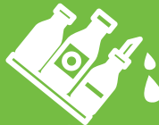
Condiment, Sauces & Syrups