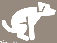
Animal Waste, Cat Litter, & Bedding