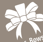
Ribbons, Bows, Gift Bags & Foil Wrapping