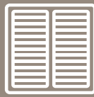
Disposable Furnace Filters