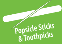
Popsicle Sticks & Toothpicks