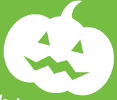
Jack O' Lanterns