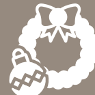
Broken Holiday Decorations