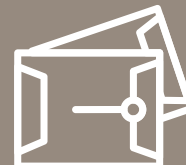
Padded Envelopes & Plastic Lined Paper