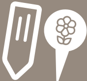
Plant & Flower Makers/Tags