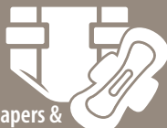
Diapers & Sanitary Products