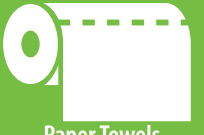
Paper Towels, Napkins & Facial Tissues