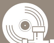
PVC & Vinyl