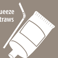
Plastic Squeeze Tubes & Straws