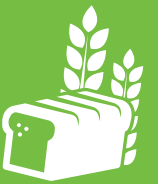
Breads & Cereals