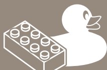
Broken Plastic Toys