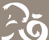
Construction Sawdust & Wood Shavings