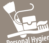
Personal Hygiene Products